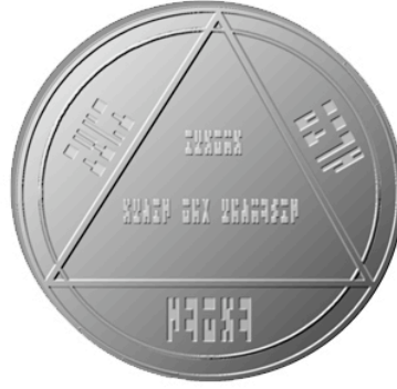
Five Thousand Marks