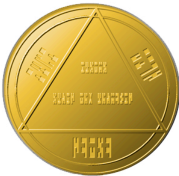
Five Hundred Marks