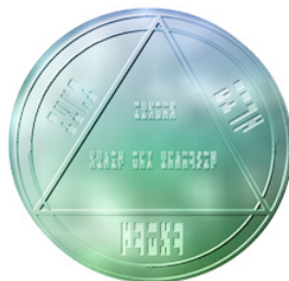
One Hundred Thousand Marks