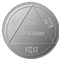
One Thousand Marks