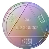
Ten Thousand Marks