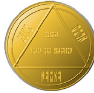
One Hundred Marks